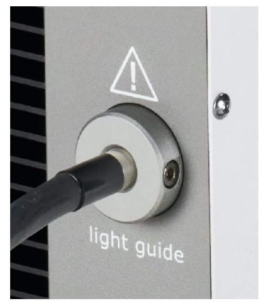
Figure 2. 3 mm diameter liquid light guide inserted in front panel light output port.

Position the unit in an orientation that allows unrestricted access to the DC power connector at the back of the light engine. In an emergency, you may need to disconnect power to the unit quickly. The master power push button switch is located in the bottom right corner of the front panel; it turns electrical power to the unit on and off. This button has a green inlay which is illuminated when power to the light engine is ON. On the top right corner of the front panel, there is also a light source enable push button, labeled "Light." The Light button is NOT a power switch; it only disables the light output while the system remains on.