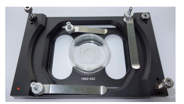
Figure 2 ZEISS level adjustable piezo stage insert

Please be aware, in order to obtain ideal TIRF illumination you need a sufficient mismatch in refractive indices. In addition you may want to change imaging buffer concentration therefore we recommend no embedding after fixation of PALM and dSTORM samples.