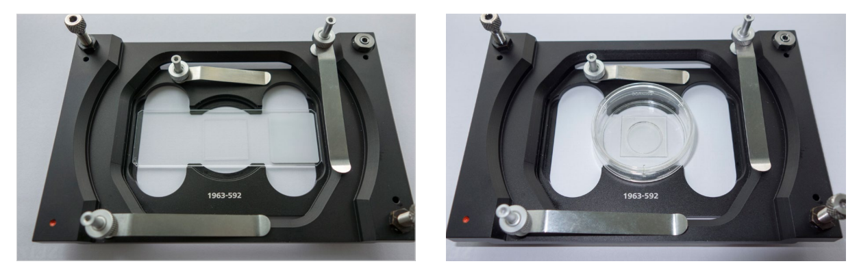
Figure 1 ZEISS level adjustable piezo stage insert

Please make sure that the coverslip is centered on the glass slide in order to fit into the sample holder. See below pictures of the ZEISS level adjustable piezo stage insert.